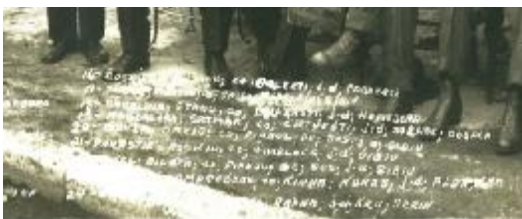
Shown above is the panoramic photo identifying each person by number; Nick Vrancean is number 15. At left is an enlarged section of the lower portion of the photo which identifies the name and town of origin of each person numbered in the picture.